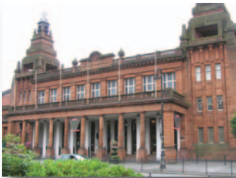
Kelvin Hall Arena