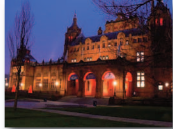
Kelvingrove Art Gallery